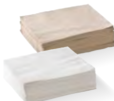
1 ply 1/4 fold L-LN1/4-1PW | L-LN1/4-1PN 3,000/ctn | 500/slv