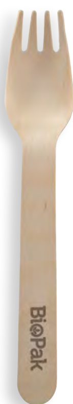
16cm fork HY-16F-COATED 1,000/ctn | 100/slv