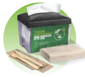
Cutlery & napkins p.30