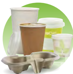
Hot cups p.6