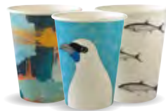
12oz BC-12-ART SERIES 1,000/ctn | 50/slv Use large lid