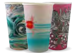
16oz BC-16-ART SERIES 1,000/ctn | 50/slv Use large lid