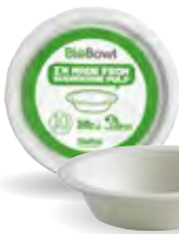
16oz (500ml) BioCane bowl RT-B-BL-16-10X10P 10/carton | 10/pack Shelf ready carton