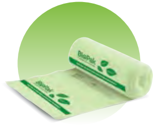
Bioplastic bags p.34