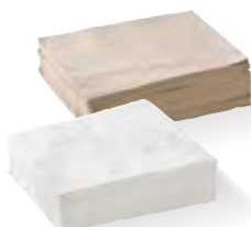
2 ply 1/4 fold L-LN1/4-2PW | L-LN1/4-2PN 2,000/ctn | 100/slv