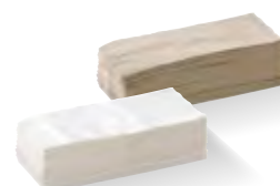
2 ply 1/8 fold L-LN1/8-2PW | L-LN1/8-2PN 2,000/ctn | 100/slv