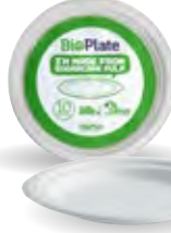
7" (18cm) round BioCane plate RT-B-PL-7-17X10P 17/carton | 10/pack Shelf ready carton