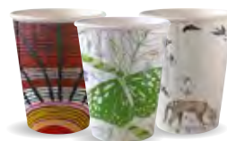
12oz BC-12DW-ART SERIES 1,000/ctn | 40/slv Use large lid