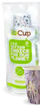
8oz (280ml) Art Series BioCups RT-BC-8 12/carton | 25/pack