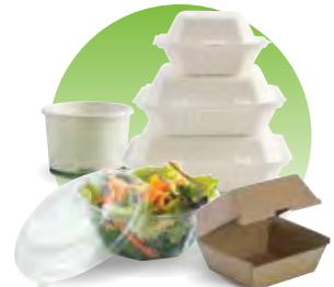
Takeaway containers p.16