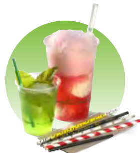
Cold cups & straws p.13