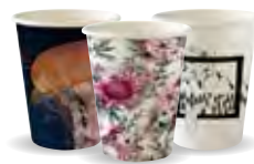
8oz BC-8-ART SERIES 1,000/ctn | 50/slv Use small lid