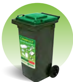
Compost Service p.4