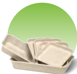
Produce trays p.26