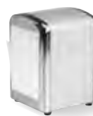
E-fold/D-fold tall/compact BioDispenser Holds 250 napkins L-TCD-TT 36/carton