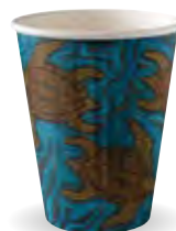
8oz BC-8DW-CCAB 1,000/ctn | 50/slv Use small lid