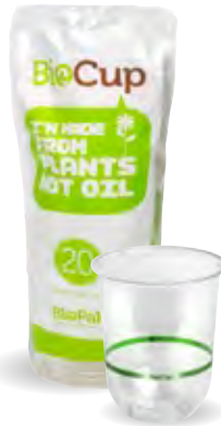
500ml tumbler clear BioCups RT-Q-500 12/carton | 20/pack