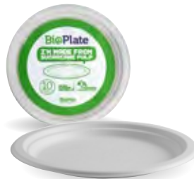
10" (25cm) round BioCane plate RT-B-PL-10-12X10P 12/carton | 10/pack Shelf ready carton