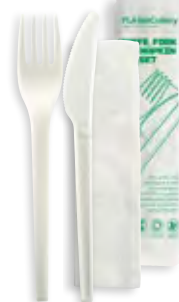
6.5" (16.5cm) knife, fork & napkin pack GD-6.5AKFN-B 250/ctn