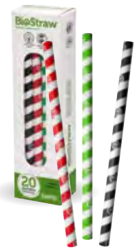
Jumbo paper straw – mixed colours RT-JP-PBS-10x197-20-MIXED 25/carton | 20/pack Shelf ready carton