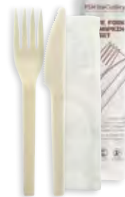
6" (15cm) knife, fork & napkin pack GD-6KFN-B 250/ctn