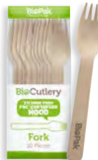
16cm wood fork RT-HY-16F-10/24X4 24/carton | 10/pack Shelf ready carton