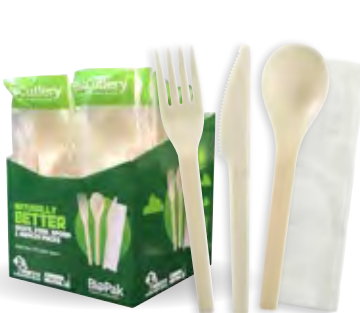
6" (15cm) PSM fork, knife, spoon & napkin sets GD-6KFSN-R 10 boxes/carton | 20 sets/retail box Shelf Ready Carton