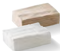
D-fold 1 ply compact L-CDN-W | L-CDN-N 5,000/ctn | 250/slv