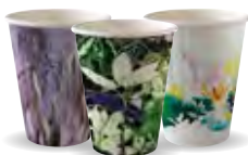
8oz BC-8DW-ART SERIES 1,000/ctn | 50/slv Use small lid