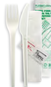
6.5" (16.5cm) knife, fork, napkin salt & pepper pack GD-6.5AKFNBP-B 250/ctn