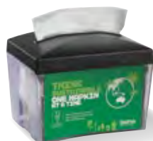
Single saver BioDispensers Holds 250 napkins | Replacement ad panel L-SSD-TT 8/carton