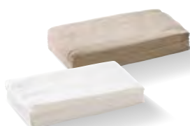
1 ply single saver L-SSDN-W | L-SSDN-N 6,000/ctn | 500/slv