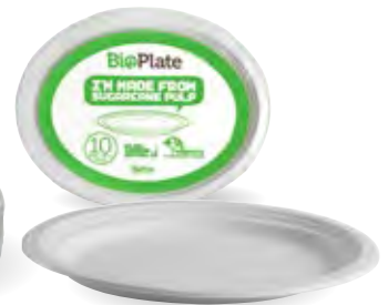
12.5" (31x25cm) oval BioCane plate RT-B-PL-16-2-12X10P 12/carton | 10/pack Shelf ready carton