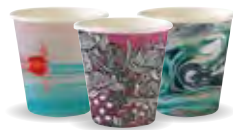
6oz BC-6-ART SERIES 1,000/ctn | 50/slv Use small lid