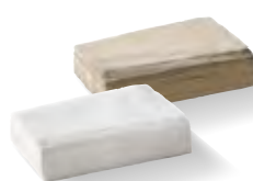
E-fold 1 ply tall L-TDN-W | L-TDN-N 5,000/ctn | 250/slv