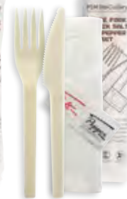
6" (15cm) knife, fork, napkin, salt & pepper pack GD-6KFNBP-B 250/ctn