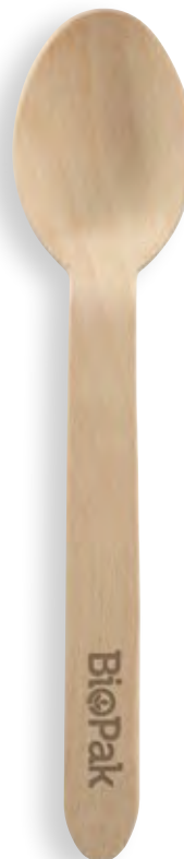
16cm spoon HY-16S-COATED 1,000/ctn | 100/slv