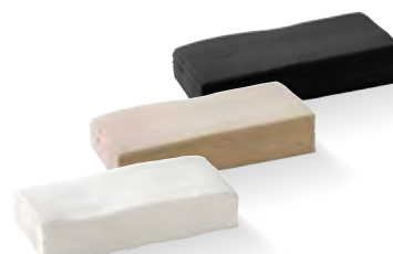
2 ply quilted 1/8 fold L-DNQ1/8-W | L-DNQ1/8-N | L-DNQ1/8-B 1,000/ctn | 100/slv