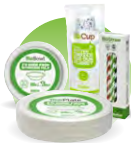
Retail range p.29