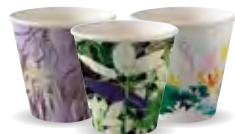
8oz (90mm) BC-8DW(90)-ART SERIES 1,000/ctn | 50/slv Use large lid