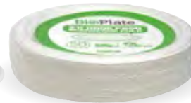
10" (25cm) round BioCane plate RT-B-PL-10-10X50P 10/carton | 50/pack