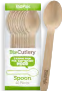
16cm wood spoon RT-HY-16S-10/24X4 24/carton | 10/pack Shelf ready carton