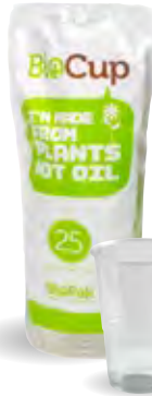
280ml clear BioCups RT-R-280 12/carton | 25/pack