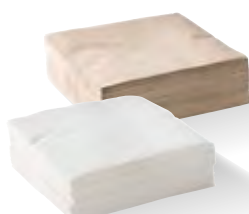
2 ply corner embossed 1/4 fold L-DNCE1/4-W | L-DNCE1/4-N 1,000/ctn | 100/slv