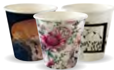
8oz (90mm) BC-8(90)-ART SERIES 1,000/ctn | 50/slv Use large lid