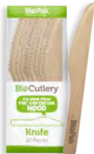
16cm wood knife RT-HY-16K-10/24X4 24/carton | 10/pack Shelf ready carton