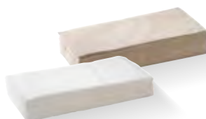
2 ply 1/8 fold L-DN1/8-W | L-DN1/8-N 1,000/ctn | 100/slv