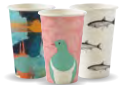
12oz (80mm) BC-12(80)-ART SERIES 1,000/ctn | 50/slv Use small lid