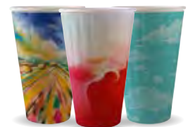
16oz BC-16DW-ART SERIES 600/ctn | 40/slv Use large lid