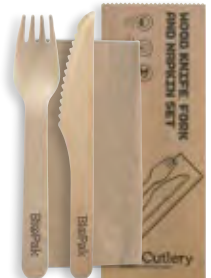
16cm knife, fork & napkin set HY-16KFN 400/ctn | 100/slv