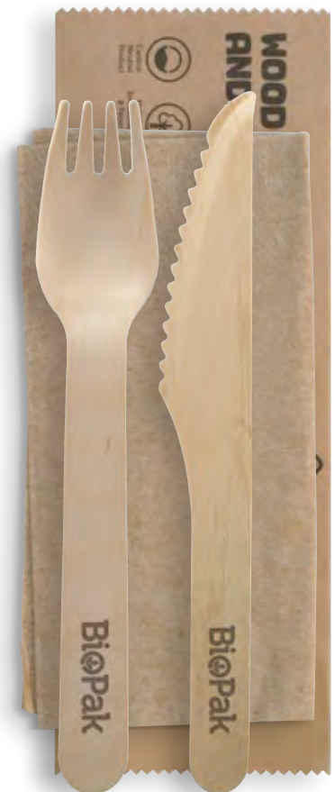
16cm knife, fork & napkin set HY-16KFN-COATED 400/ctn | 100/slv