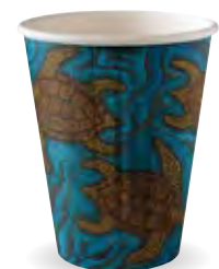
12oz BC-12DW-CCAB 1,000/ctn | 40/slv Use large lid